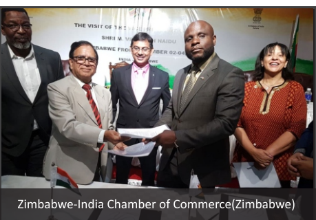
Zimbabwe-India Chamber of Commerce(Zimbabwe)