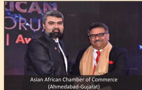
Asian African Chamber of Commerce (Ahmedabad-Gujarat)