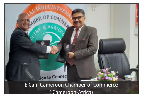
E.Cam Cameroon Chamber of Commerce ( Cameroon-Africa)