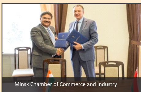
Minsk Chamber of Commerce and Industry