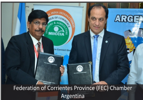
Federation of Corrientes Province (FEC) Chamber Argentina