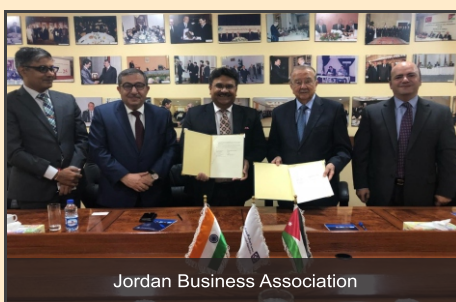
Jordan Business Association