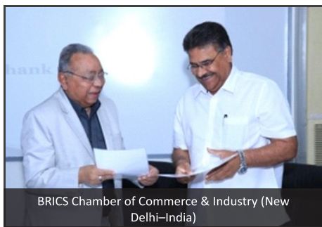
BRICS Chamber of Commerce & Industry (New Delhi-India)