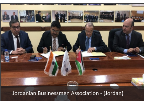
Jordanian Businessmen Association - (Jordan)