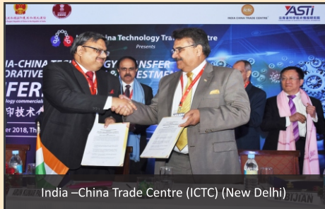
India –China Trade Centre (ICTC) (New Delhi)