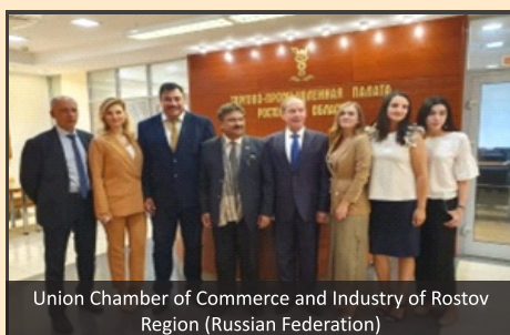
Union Chamber of Commerce and Industry of Rostov Region (Russian Federation)