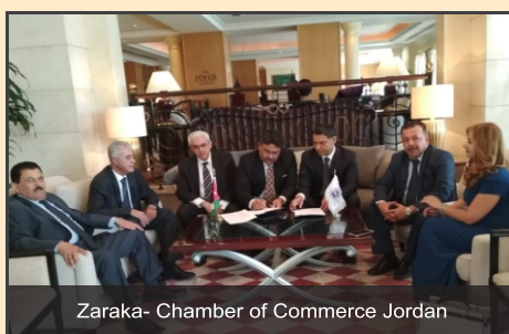
Zaraka- Chamber of Commerce Jordan