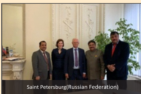
Saint Petersburg(Russian Federation)