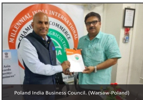
Poland India Business Council. (Warsaw-Poland)