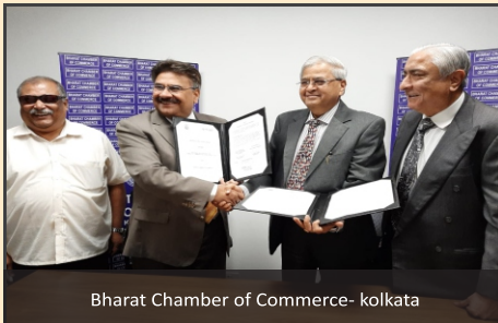
Bharat Chamber of Commerce- kolkata