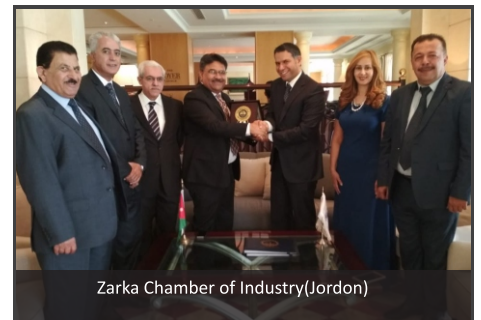
Zarka Chamber of Industry(Jordan)