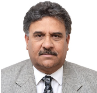
Ambassador Anil Trigunayat, IFS (Retd.)