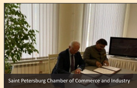
Saint Petersburg Chamber of Commerce and Industry