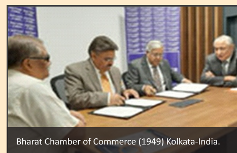
Bharat Chamber of Commerce (1949) Kolkata-India.