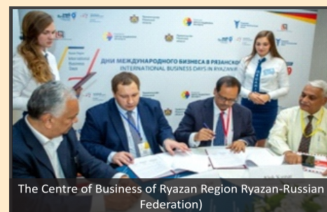
The Centre of Business of Ryazan Region Ryazan-Russian Federation)