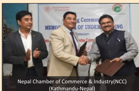
Nepal Chamber of Commerce & Industry(NCC) (Kathmandu-Nepal)