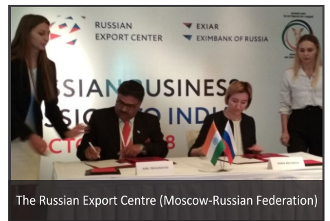
The Russian Export Centre (Moscow-Russian Federation)